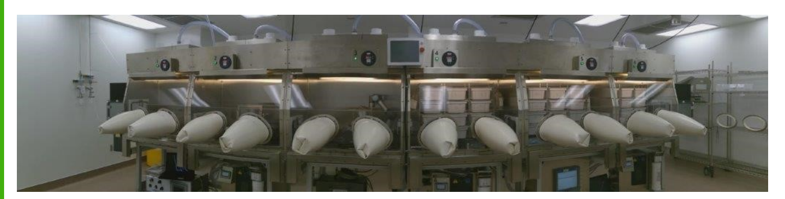
Custom 6-Section Glove Box