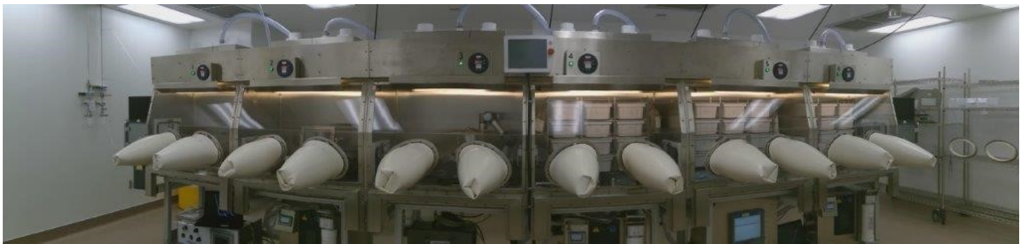
Custom 6-Section Glove Box